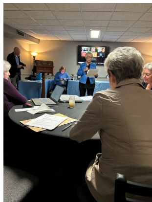
Presentation of the CFUW Brantford Procedures Manual 2024 for approval to be shared with National and Ontario to assist other clubs. Teddy B.