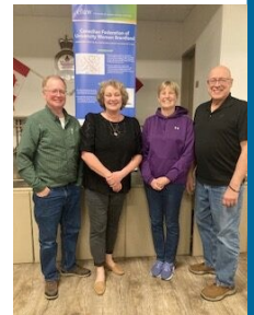
3rd Place Team