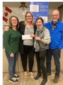
1st Place Team