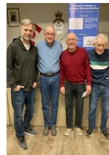
2nd Place Team